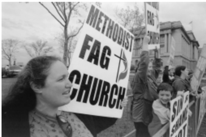
Hecklers shout and hold anti-gay signs during the gay rights march outside the convention center.