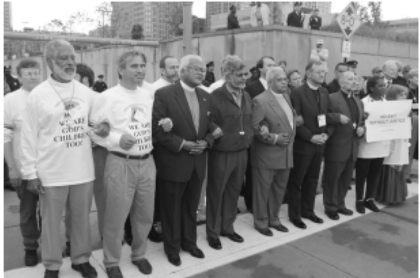
CIVIL DISOBEDIENCE – Leaders commit an act of civil disobedience as they block the entrance to the convention center in protest of The United Methodist Church's policies regarding homosexuality.