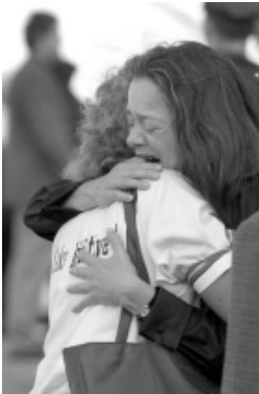
ANGUISHED — A woman cries while Cleveland police arrest people protesting The United Methodist Church's anti-homosexual policies.